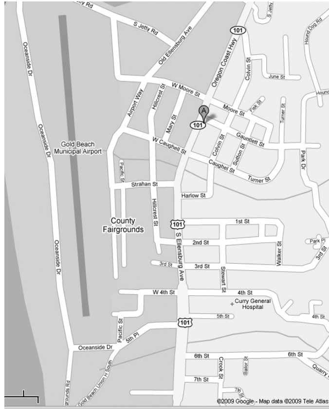
Corner of Gauntlett and Ellensburg Ave (across from the Court House).

Join us for fun and feasting in our dining room or in the Cove, our outdoor patio!